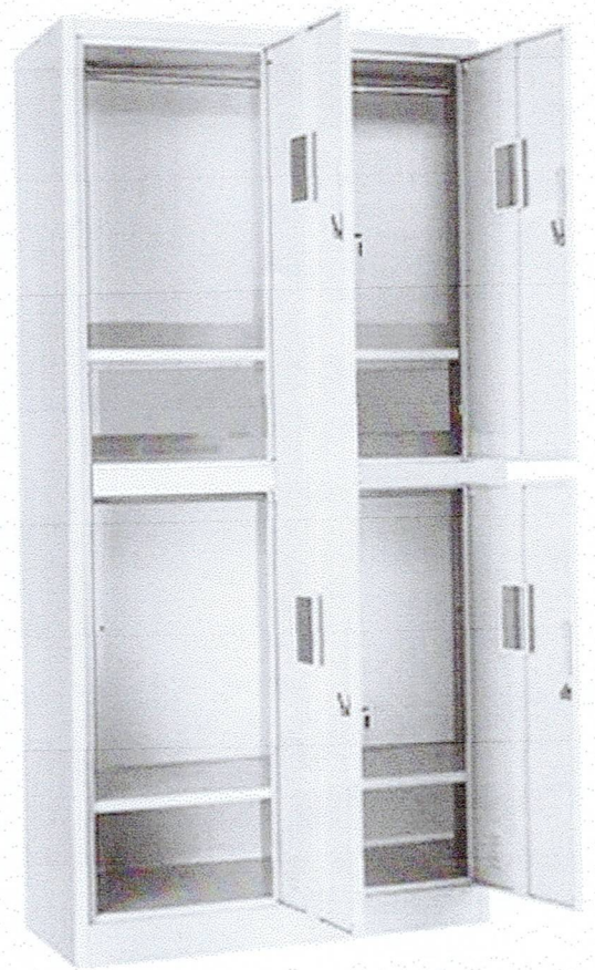
STEEL LOCKER CABINET H1800xW900xD450 mm