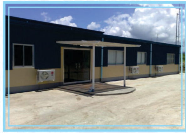
LEIAAI, San Fernando City, La Union Office