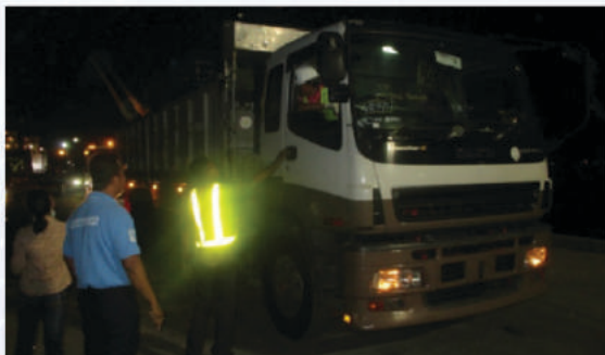
Inspection of imported articles at San Fernando International Seaport

As the estate manager over the freeport zone, PPMC implements traffic regulations as deputized Land Transportation Office (LTO) officials.