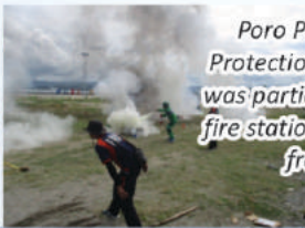
Poro Point Baywalk hosted the Bureau of Fire Protection (BFP) Regional Fire Olympics. The event was participated in by BFP personnel from different fire stations, civilian from barangays and personnel from industrial/oriented companies.