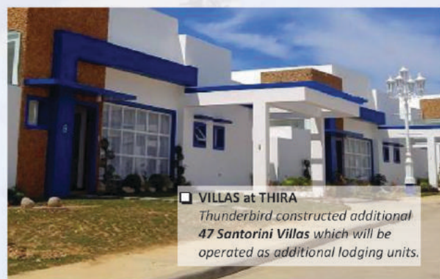
■ VILLAS at THIRA Thunderbird constructed additional 47 Santorini Villas which will be operated as additional lodging units.