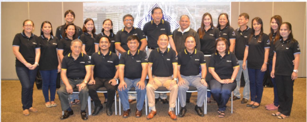
PPMC Board of Directors and Officers