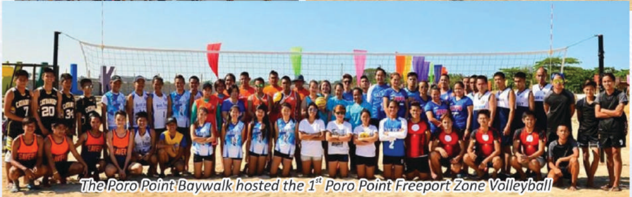
The Poro Point Baywalk hosted the 1 st Poro Point Freeport Zone Volleyball