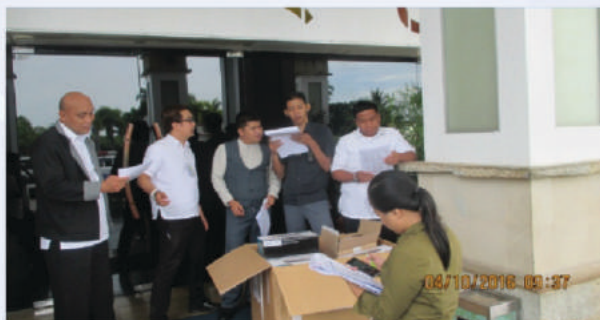
Joint Inspection with PAGCOR of imported casino equipment