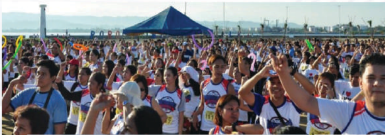
The baywalk hosted several fun runs, team building activities, zumba sessions and sportsfest