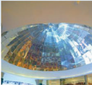
❑ Fiesta Casino Expansion