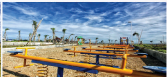
Playground equipment for children and their families to enjoy

On February 14, 2016, PPMC opened the baywalk to the public with its first ever event. PPMC organized an event dubbed as “Valentine Date by the Bay.” The event featured a dating game, various performances and a Rock and Rave Party.