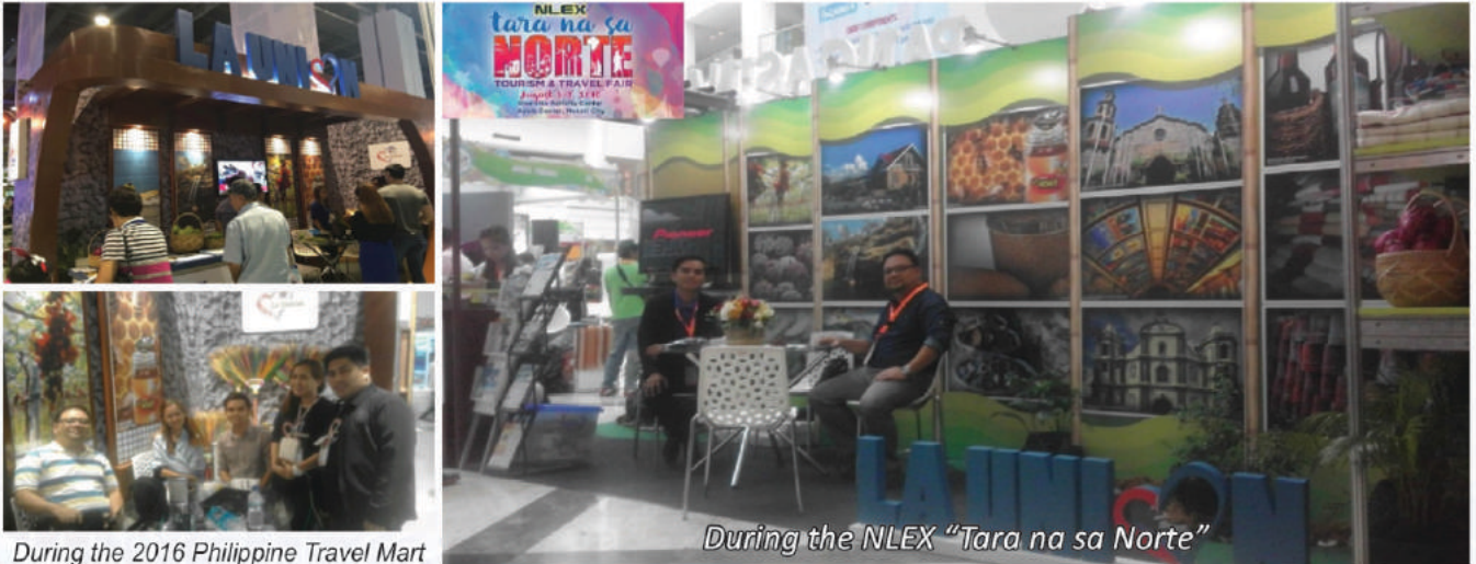
During the 2016 Philippine Travel Mart

PPMC joined the Provincial Government of La Union (PGLU) in three (3) major tourism and marketing events namely: NLEX “Tara na sa Norte” Tourism and Travel Fair, Philippine Travel Mart and the Annual Region I Tourism Convention