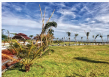
Palm trees have been planted to enhance the beauty of the place