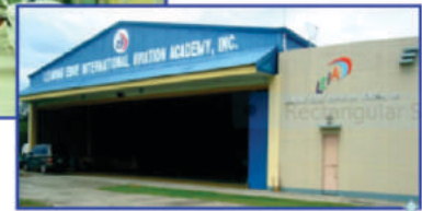
Maintenance Hangar San Fernando Airport, San Fernando, La Union

Can accommodate LEIAAI's fleet of aircraft.