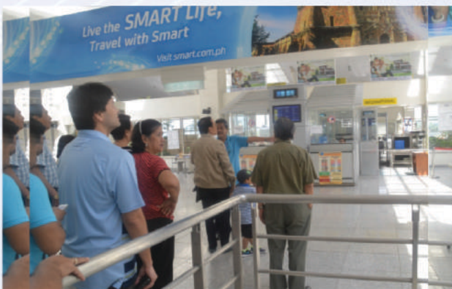
Ocular inspection of the facilities of the new Iloilo International Airport, conducted a bench marking with existing San Fernando Airport facilities. PPMC Board of Directors looked into the transformation of the old Iloilo Airport to a new business District of the City.