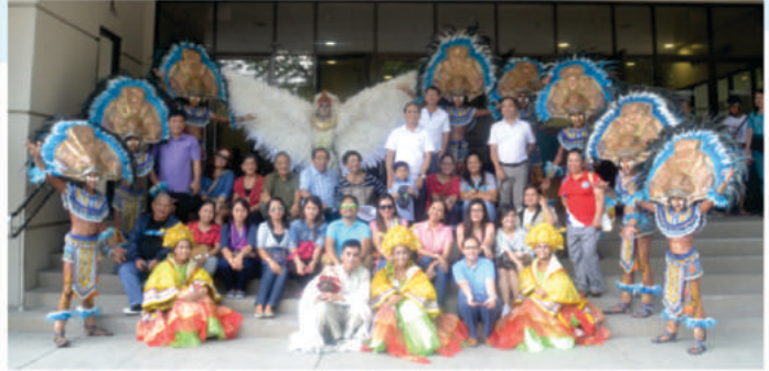
Board of Directors and Officers were welcomed by the Iloilo Dinagyang Festival dancers