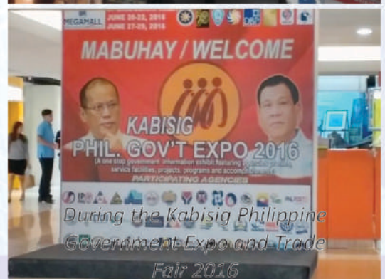
During the Kabisig Philippine Government Expo and Trade Fair 2016