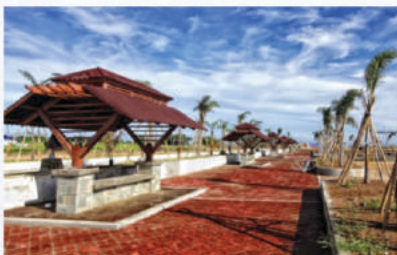
44 gazebos line the 1.3 kilometers baywalk

The Poro Point Baywalk is a 1.3 kilometers baywalk and features an events center, pedestrian walk and a separate bicycle lane, complemented by parks, playgrounds, picnic area, gazebos, and commercial strip.