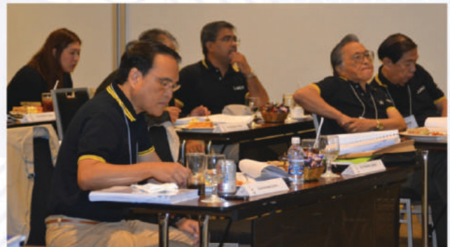
PPMC Board at work