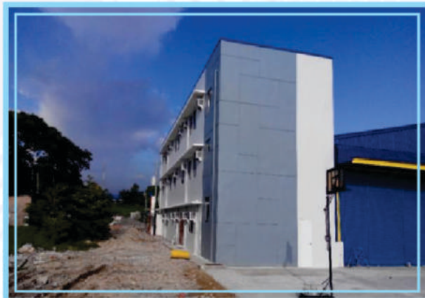
Apartment Quarters (three floors) for Instructors & Students Pilot.