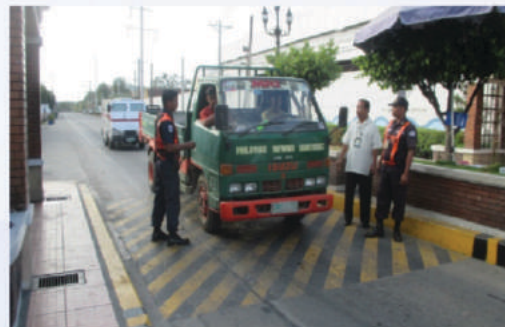
Implementation of LTO Traffic Rules & Regulations