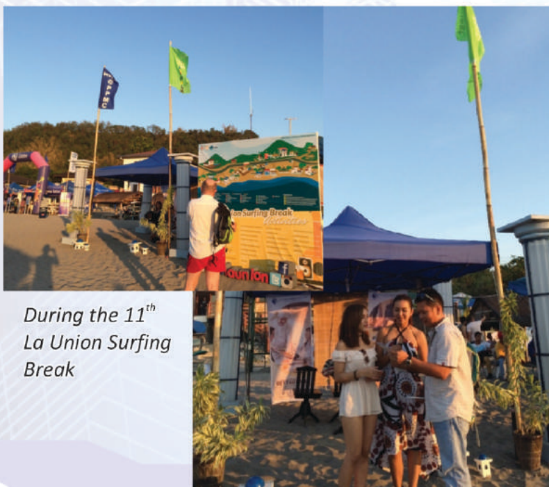
During the 11 th La Union Surfing Break