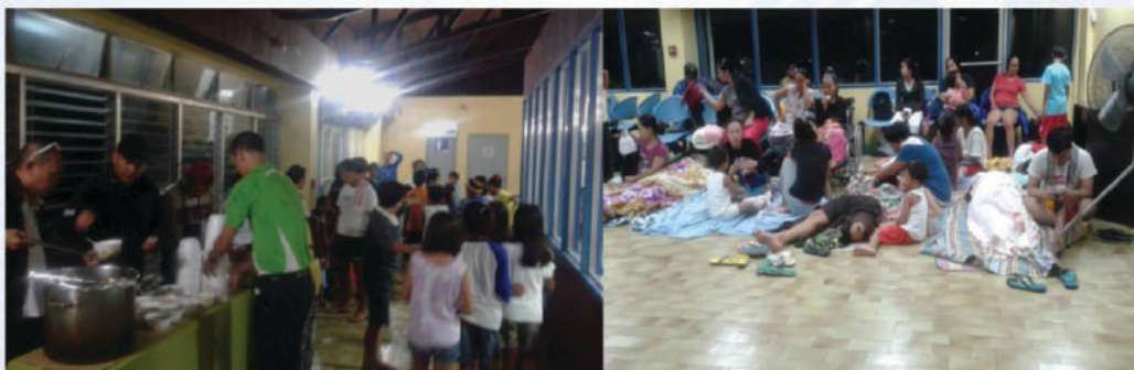
Feeding assistance provided by Thunderbird Pilipinas Hotels and Resorts, Inc., one of the Poro Point Freeport Zone (PPFZ) locators which joined PPMC in efforts to assist 42 families affected by typhoon “Lawin”.

On October 19-20, 2016, typhoon “Lawin” struck the province. PPMC provided assistance to 200 families of the PPFZ impact barangays. Likewise, PPMC supported the Disaster Preparedness Program of the Philippine National Red Cross- La Union Chapter.