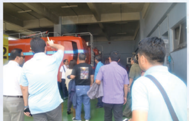
Board of Directors inspects the fire trucks and fire fighting equipment of the New Iloilo City Airport