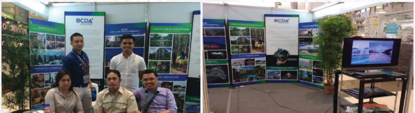
PPMC joined BCDA during the 2016 North Philippines Travel Expo in Clark, Pampanga