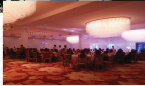
Thunderbird expanded its events center facility - the Agora Events Center . It can accommodate up to a maximum of 1,200 people.