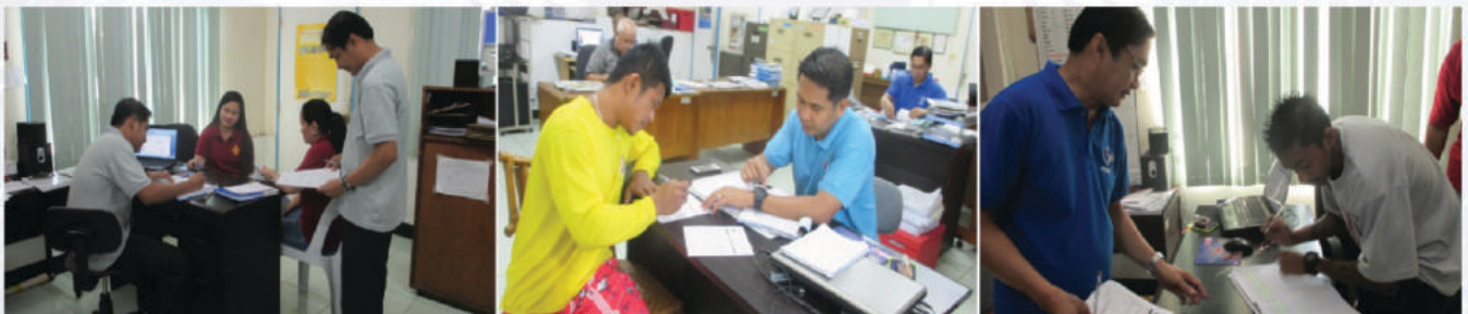
PPMC Office for Regulatory for Services Officers issuing certificates and permits to stakeholders such as Certificate of Registration, Certificate of Accreditation, Permit to bring-in local/imported articles, Permit to bring-out Local/imported articles, Gate Pass, and Import Permit