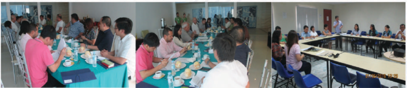
PPMC convenes with the PPFZ registered business enterprises quarterly for updates & reminder to adhere the Laws, Rules & Regulations governing PPMC & the government in general

PPMC requires PPFZ Locators and PPFZ Accredited Enterprises to secure the necessary permits for any article, substance, merchandise, transaction, activity, or operation in the PPFZ. The Office for Regulatory Services (ORS) issues Certificate of Registration to Registered Enterprises and Certificate of Accreditation to Accredited Enterprises within thirty (30) calendar days from submission of complete application and required supporting documents. To streamline the services offered by ORS to stakeholders, the Performance Agreement of PPMC with GCG has simplified the turn-around processing time to be able to fast track issuance of certificates and permits applied by PPFZ Enterprises reduced from 30 calendar days to three (3) working days for Renewal of Existing Certificate of Registration and one (1) work day for Granting of New and Renewal of Existing Certificate of Accreditation or Permit to Operate.