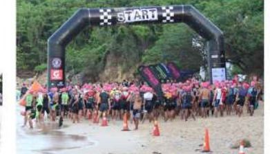
Rockstar 113 Triathlon