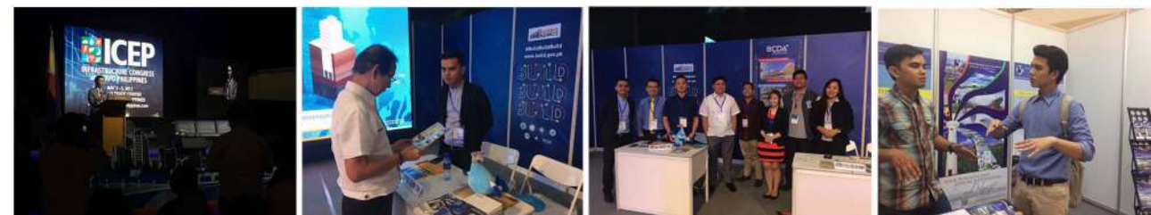
(ICEP) Infrastructure Congress and Expo Philippines