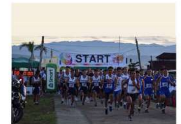
Philippine Information Agency Region I Takbo para sa ASEAN