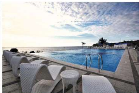
FIRA Brach Club with its Infinity Pool