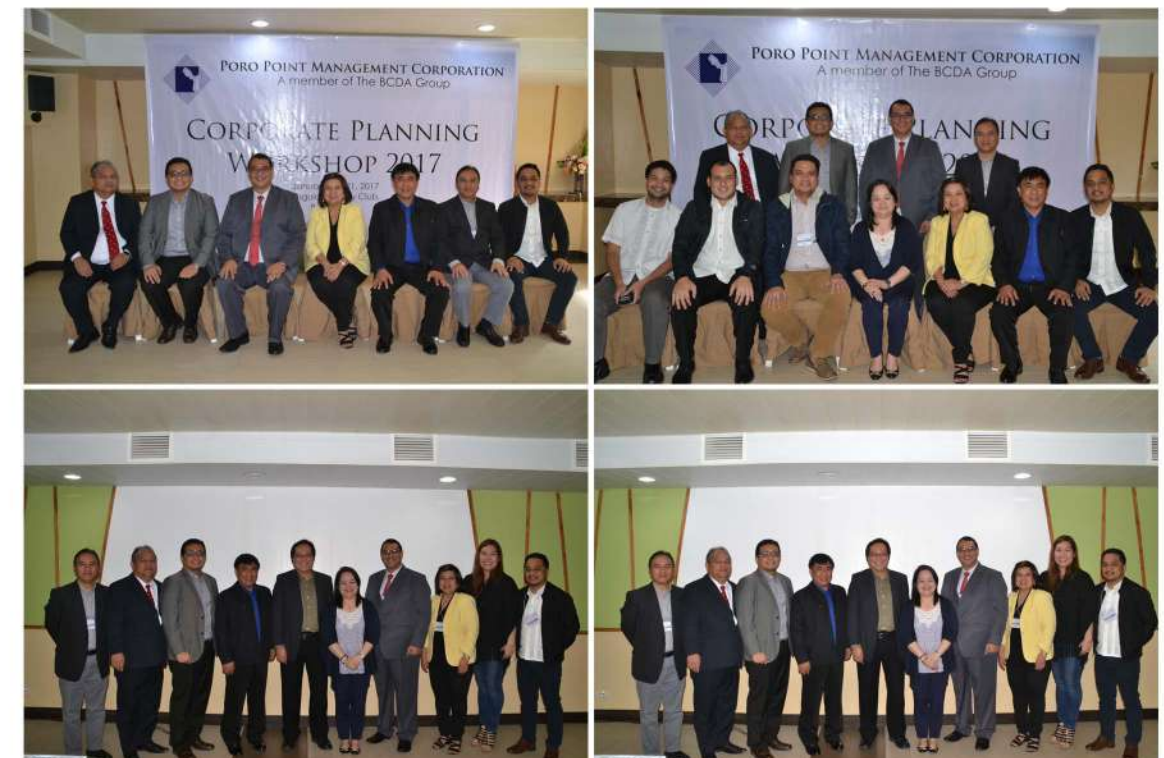
Conducted the Mid - year Performance Assessment and Corporate Planning Workshop in Hotel Luna, Vigan City on June 28 - 30, 2017.