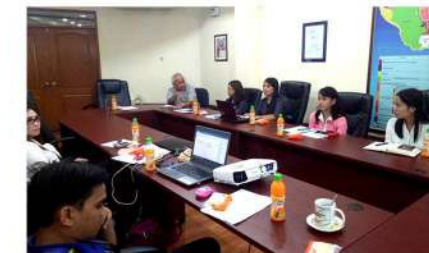
The ISO Training and Development Team spearheaded the orientation on the new revision of the Citizen's Charter.