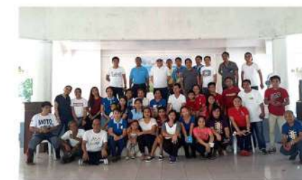
PPMC Family Day and Team Building Activities at San Luis Del Mar, Bauang, La Union