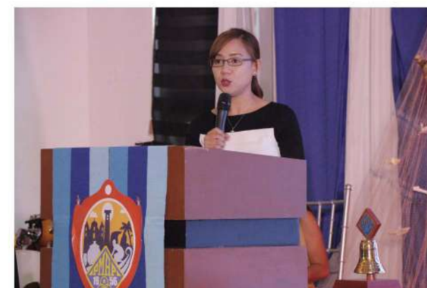
PPMC was one of the presentors and exhibitors during the 11th PMAP Luzon Summit. PPMC showcased the ongoing developments and areas of investments inside the Poro Point Freeport Zone