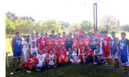
The annual PPMC Sportsfest