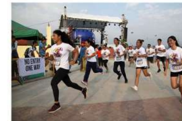
City of San Fernando Sundown Festival