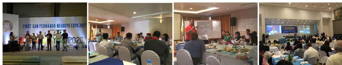
First San Fernando Negosyo Expo