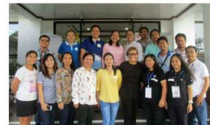
Workshop on Rediscovering Marketing conducted by Bases Conversion Development Authority