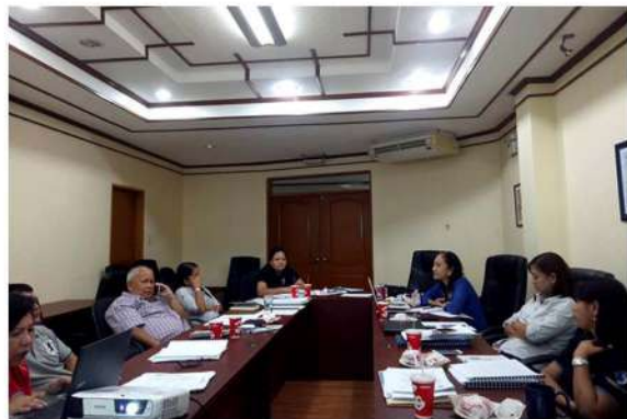
The EO 36 Composite Team conducted series of meetings regarding the implementation of the modified salary structure.

Based on the review and analysis conducted, the Composite Team recommended to adopt and implement the Modified Salary Schedule under Executive Order No. 201, and the allowances, benefits and incentives under J.R. No. 4. The recommendation was approved by the PPMC Board of Directors during the 178 th Regular Board Meeting held on December 14, 2017. Subsequently, on December 27, 2017, PPMC submitted its application to GCG for the latter's approval of PPMC's adoption and implementation of the aforesaid Modified Salary Schedule under Executive Order No. 201, and the allowances, benefits and incentives under J.R. No. 4.