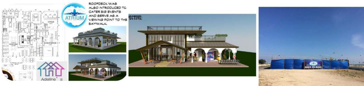
First Baywalk Locator Adeline's House of Food and Beverage and Atrium Travel and Tours

Before the year ended, another enterprise, Lemon Hub, also signified its intent to locate at the baywalk and reserved a lot for the establishment of a Food Park.