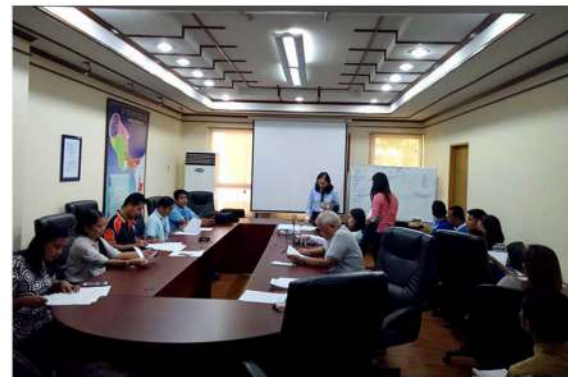
The process of the implementation of the EO 36 was explained to the employees.