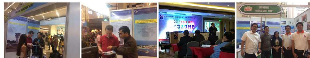
North Philippine Expo