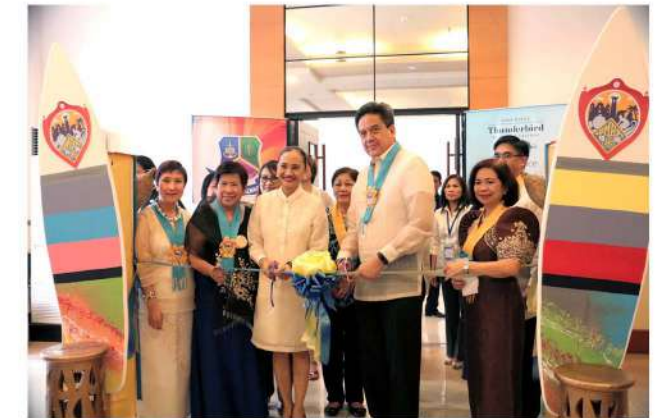
The summit included an exhibit showcasing the Province of La Union.