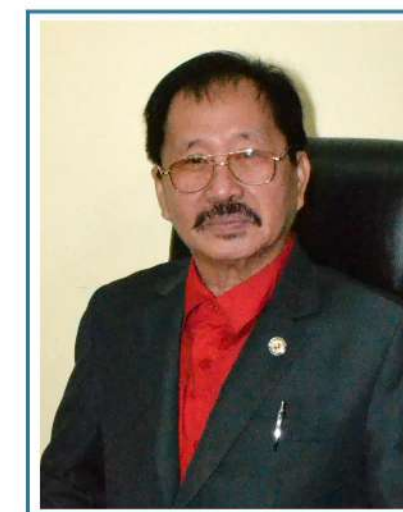
Director Age: 60years old Date of Appointment: February 03, 2017 Committee Memberships: Chairman: Special Projects Member: Audit and Risk Oversight Executive Committee Finance Audit and Risk Oversight Corporate Governance Human Resource Infrastructure Management Legal and Regulatory Concerns Nominations and Remunerations Investment and Promotions