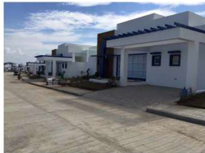
New Santorini Villas

Moreover, the development of ten (10) Presidential Suites at the amphitheater area is likewise in progress and is 90% completed as of December 31, 2017.