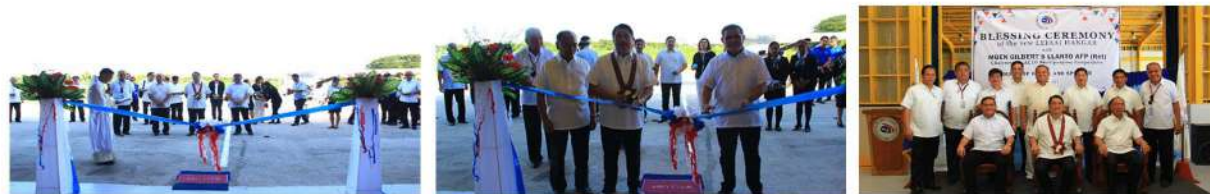
F. 2 Blessing Ceremony of the new LEIAAI Hangar II

G. Inspection of LEIAA Hangar Fire Hydrant, Fire Exits and other requirements of R. A. 9514 dated September 25, 2017.