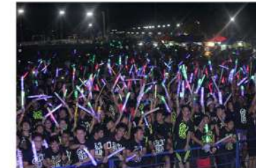
LORMA Glow Run