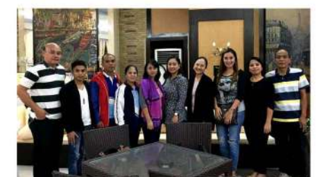
Members of the Bids and Awards Committee (BAC), BAC Secretariat and Technical Working Group attended the training on Government Procurement Reform Act (RA 9184) pursuant to its Capacity Building Program.