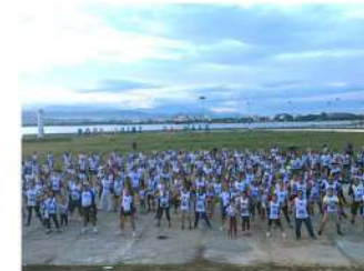
Department of Trade and Industry Region I Consumer Fun Run

With its scenic view and available facilities, the baywalk is now fast becoming a popular location for events and other activities. The baywalk hosted several fun runs, team building activities, zumba sessions, sportsfest, youth camp and festivals organized by various agencies, both government and private, and civil society groups. A total of thirty-three (33) events were held at the baywalk while approximately thirty (30) groups of guests, visitors and prospective locators visited the baywalk and the whole Zone for 2017.