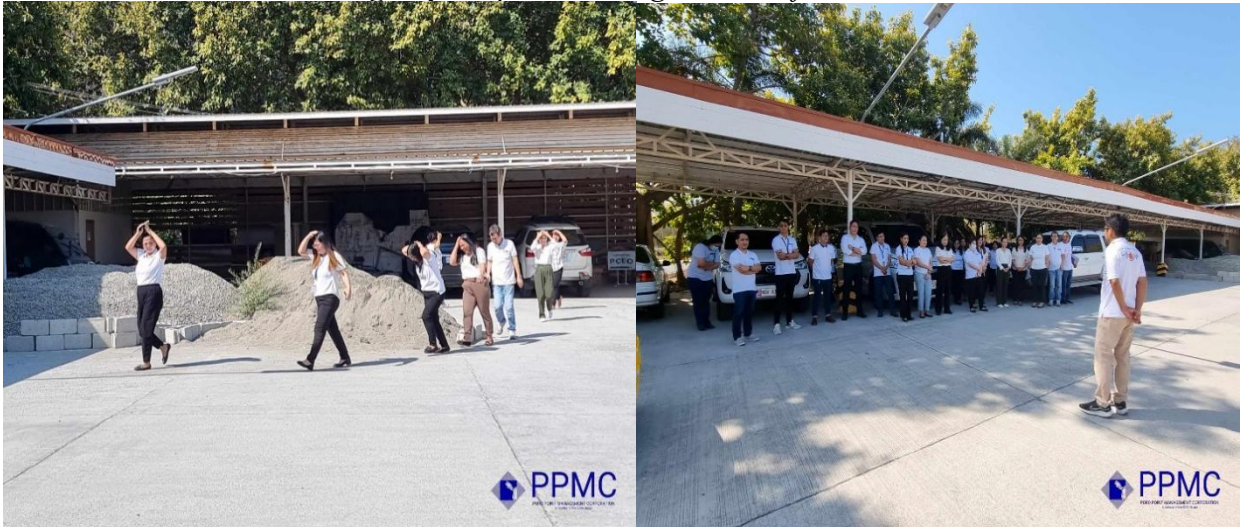
Quarterly participation during the National Simultaneous Earthquake Drill