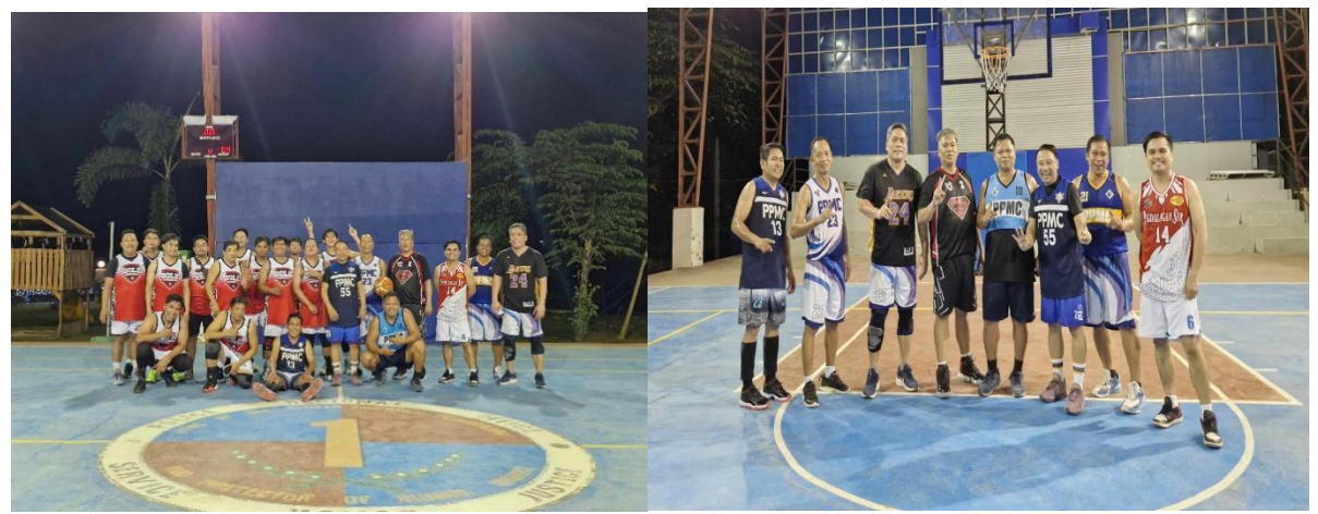
Active participation during invitational sports activities with other Government offices