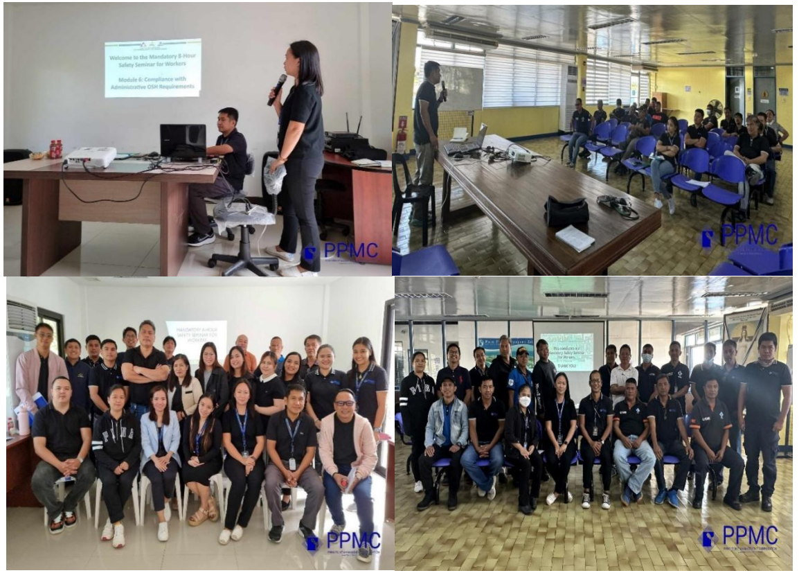
Conduct of Mandatory 8-hour Safety and Health Training for Workers