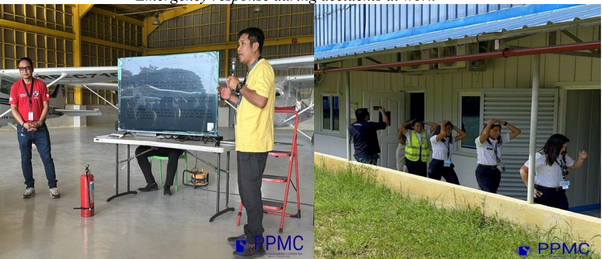
Conducted Fire and Earthquake Drills with our Locators