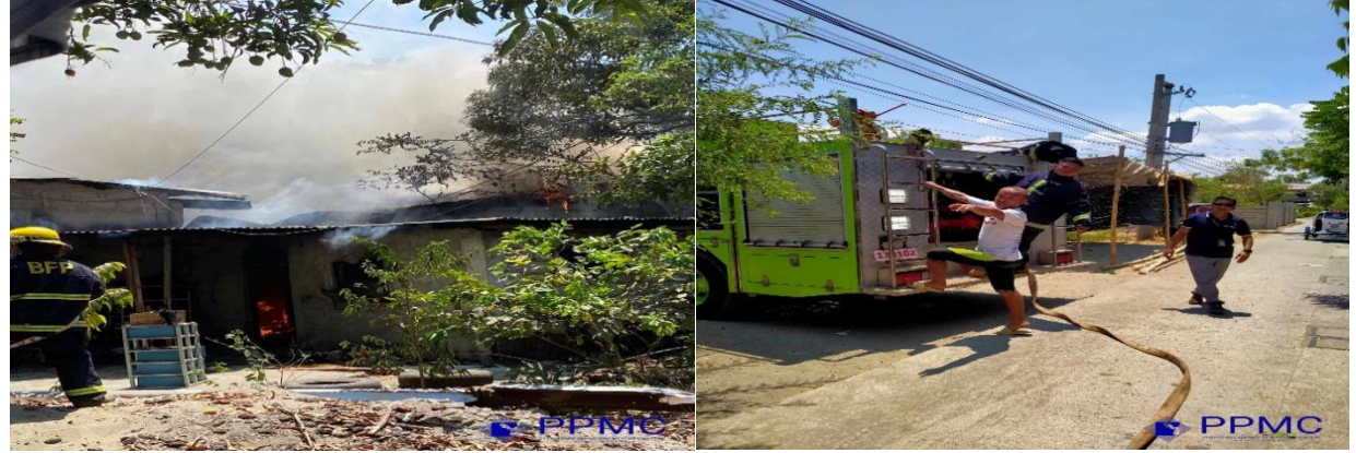
Emergency response during a fire incident