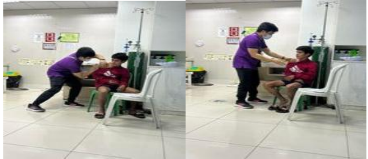
Emergency response during accidents at work