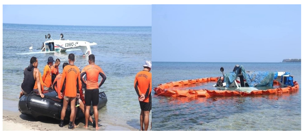
Emergency Response during an aircraft accident