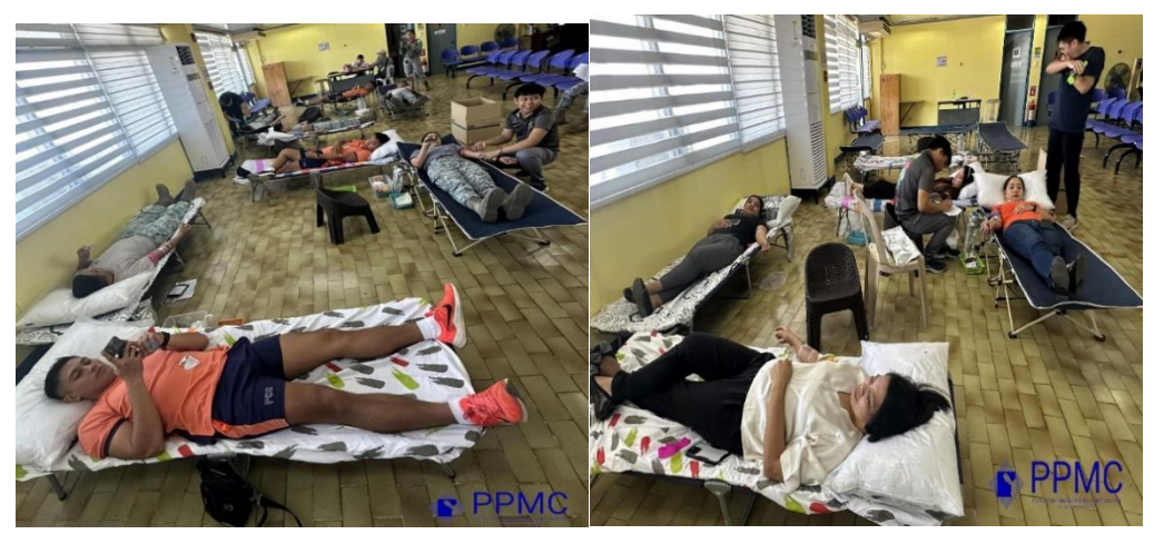
Assistance and participation during Blood-letting programs