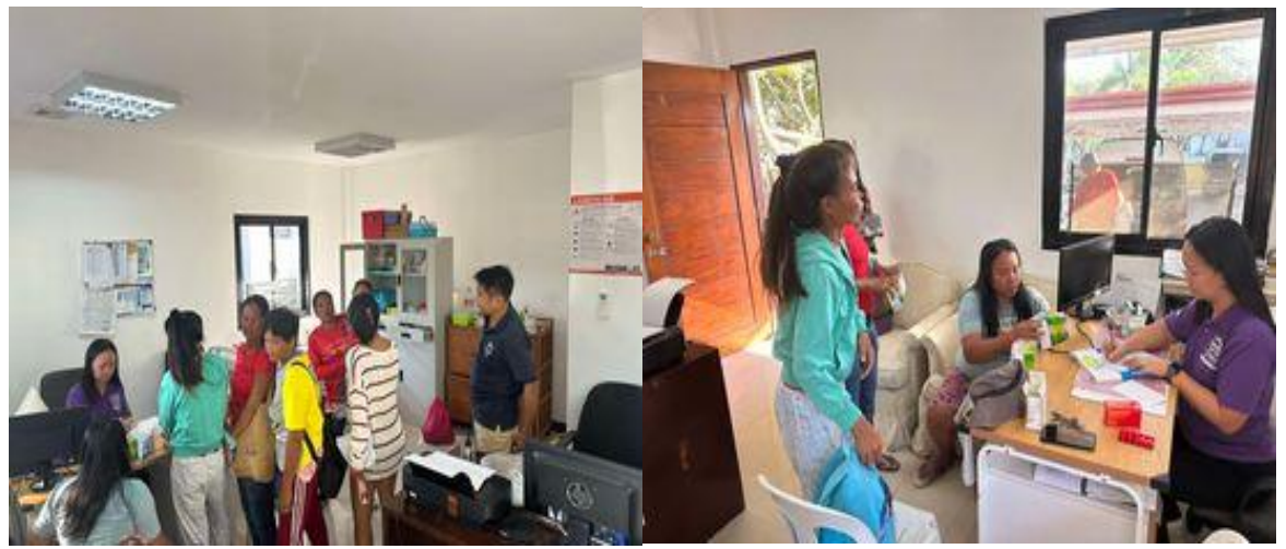
Provided Medical Assistance to our contracted laborers