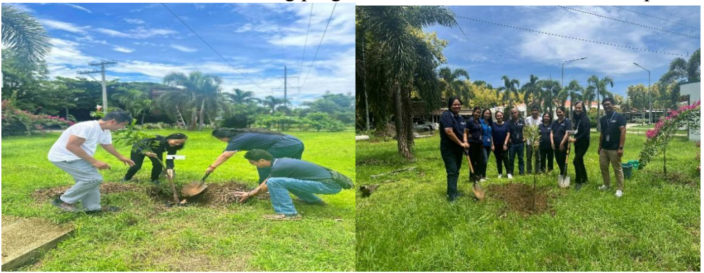
Participation during the National Arbor Day