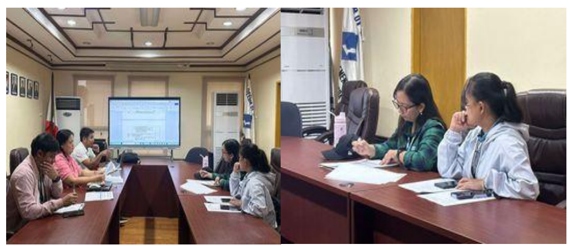
Meeting with DENR regarding their Notice to Conduct Site Monitoring to validate compliance with the conditions of ECC and other Environmental Laws