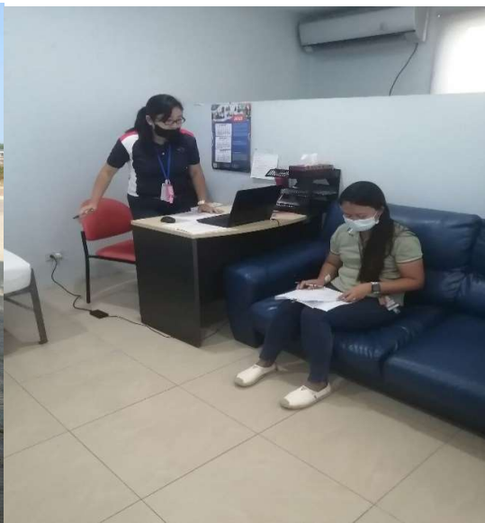
Conducted the 2 nd Quarter Inspection of Locators in Compliance with ECC Conditionalities and OSH Standards on June 22-23, 2023.