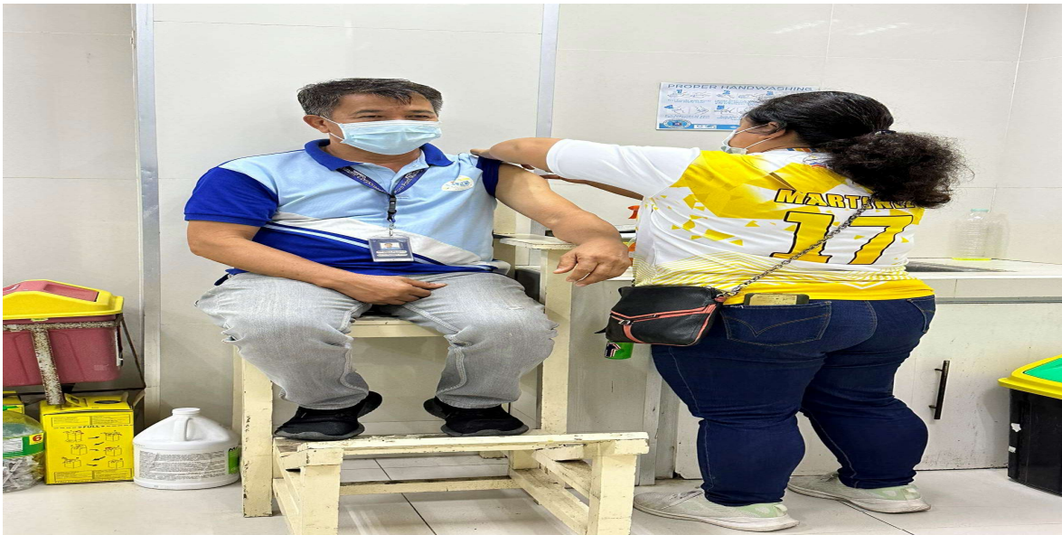
Responded to an emergency situation at the San Fernando airport and assisted the employee for medical intervention on June 9, 2023.