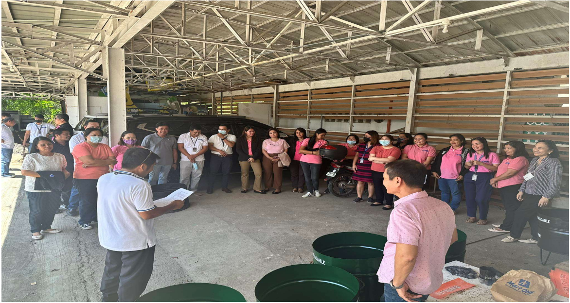
Participation of PPMC employees in the conduct of the 2 nd National Simultaneous Earthquake Drill on June 8, 2023.