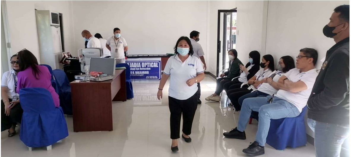
Ensuring employees' welfare thru conduct of onsite eye-consultation on February 6, 2023, 45 employees from PPMC, Mckleene Premium Products, Inc. AVSEC and CAAP were checked during the consultation.