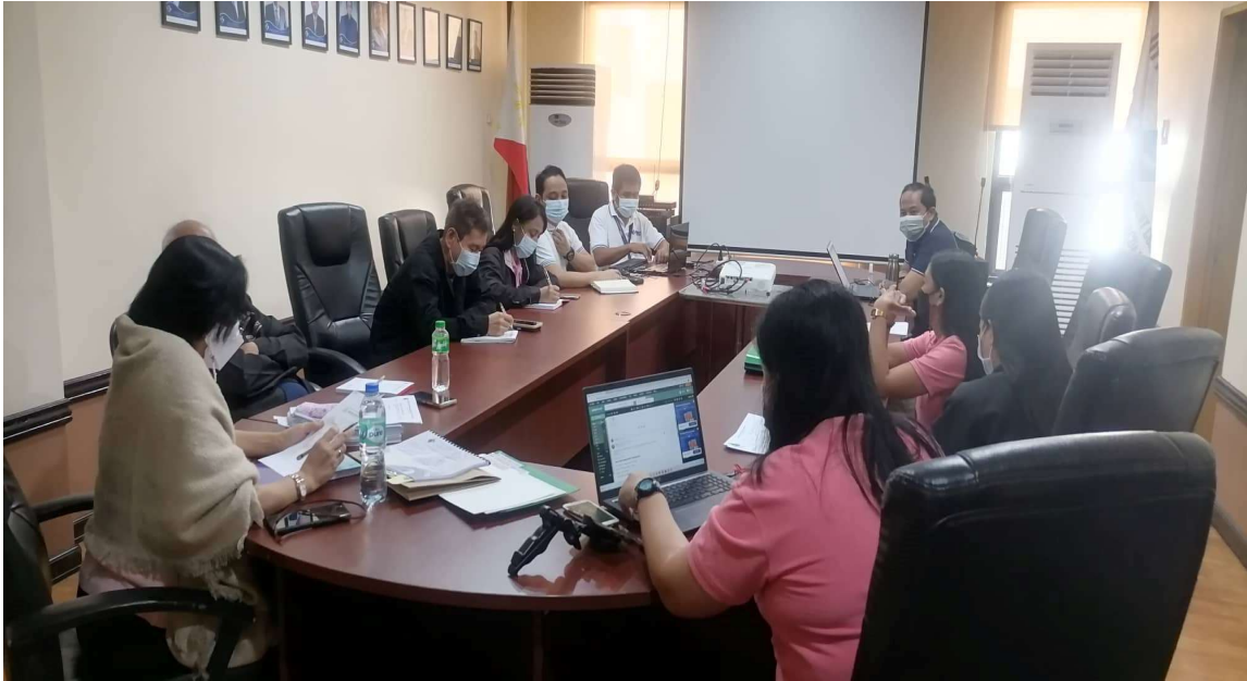
Environmental Management System meeting with Macro Vision Consultancy on January 5-6, 2023.