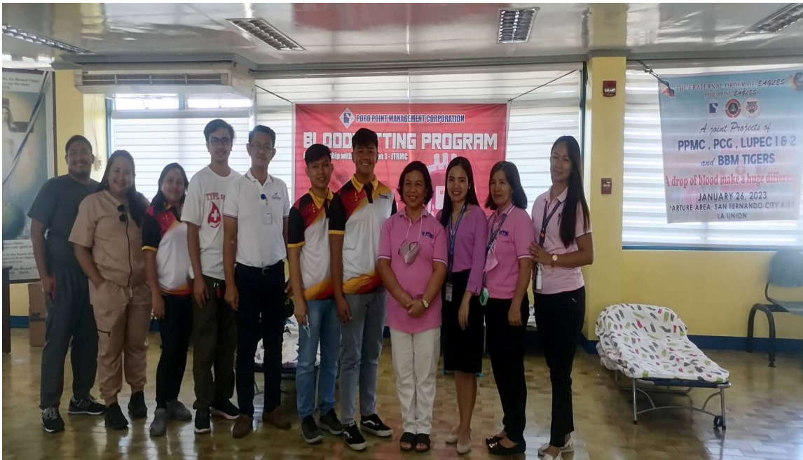
Conducted Blood letting Program at San Fernando Airport on January 26, 2023.