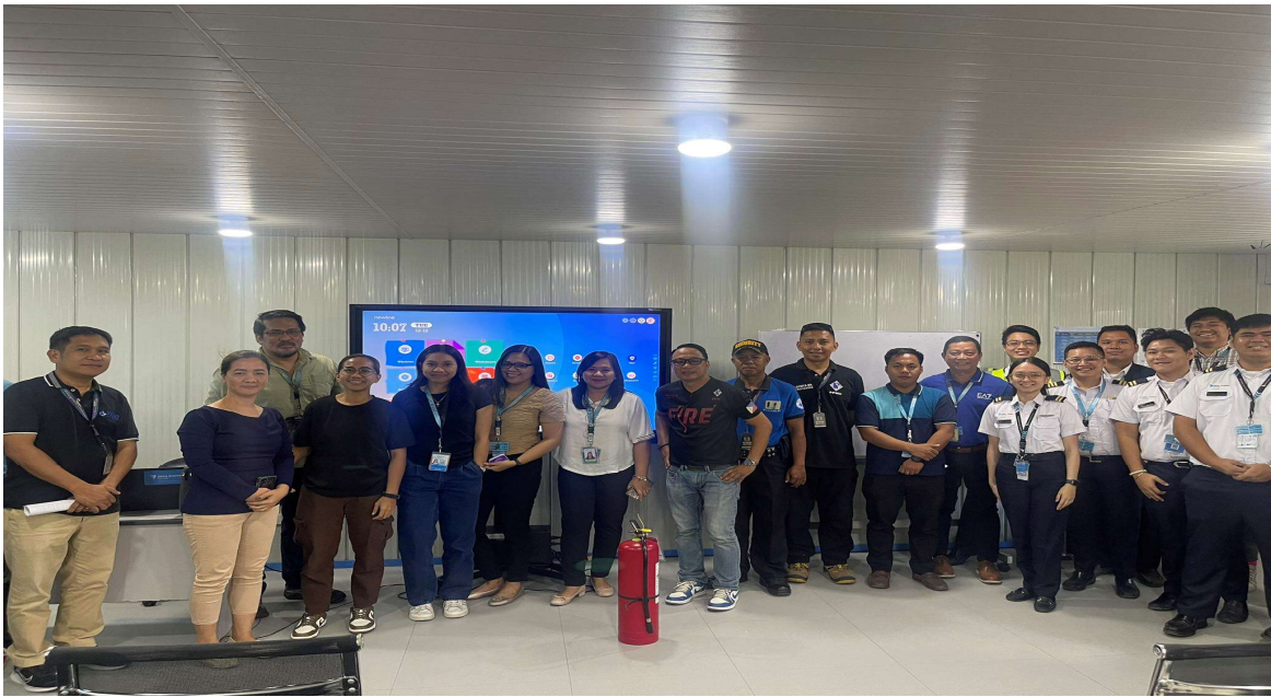
Conducted lecture on Earthquake drill at AAG International Center for Aviation Training Corp. (AICAT) on December 13, 2023