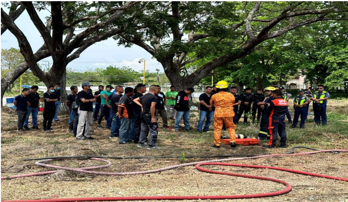
Participated during the Basic Firefighting Refresher Course conducted by Bureau of Fire Protection on May 17, 2023.