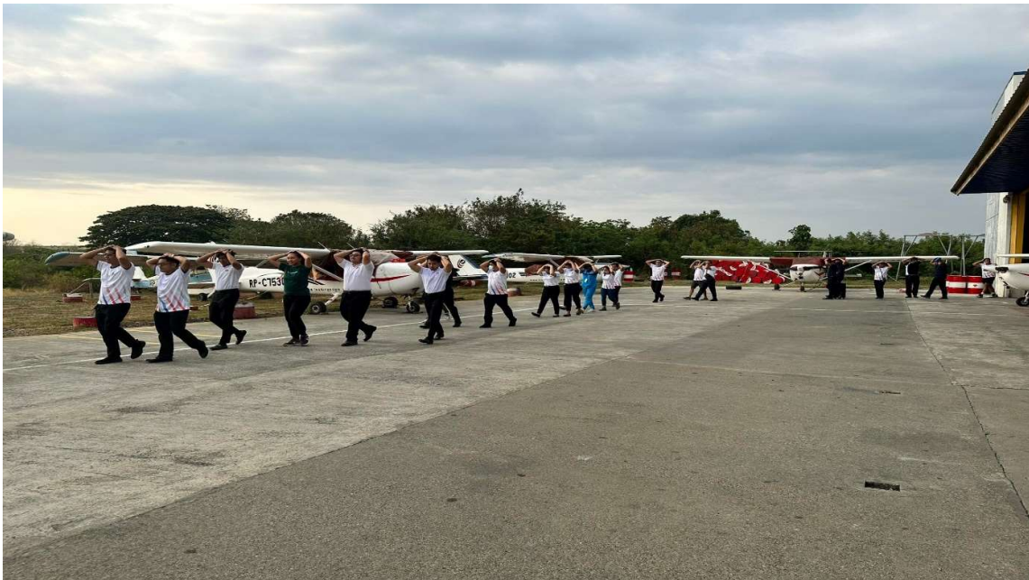
Conducted Earthquake drill at LEIAAI on March 29, 2023