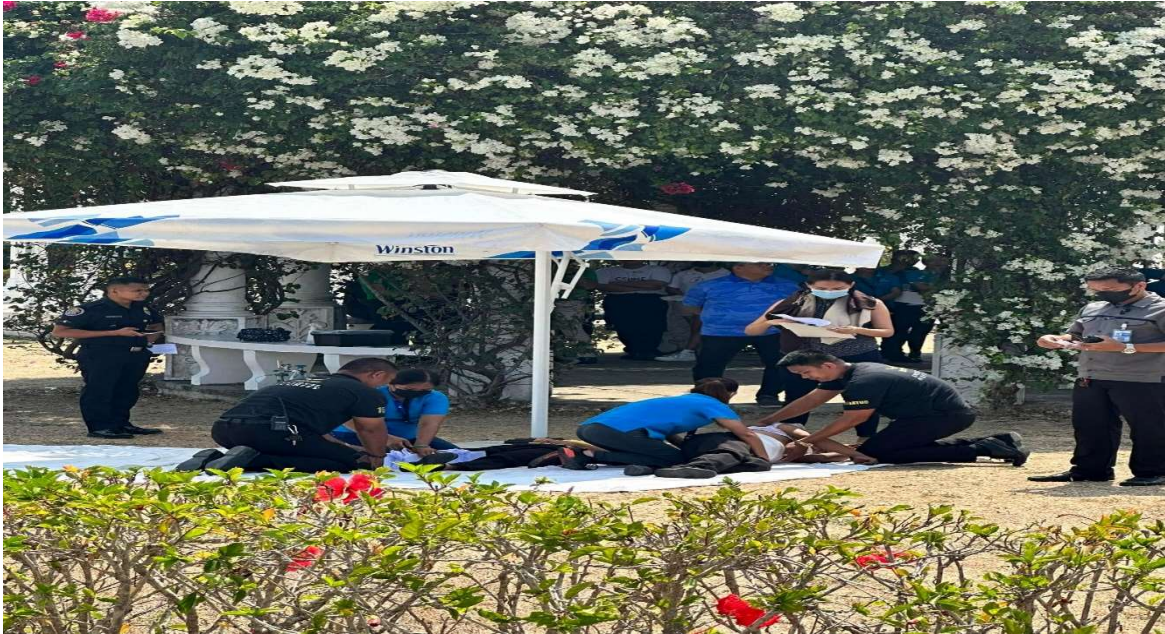
Participated during the conduct of Fire Drill and simulation at Thunderbird Pilipinas Hotel and Resorts Inc. (TPHRI) on April 28, 2023.