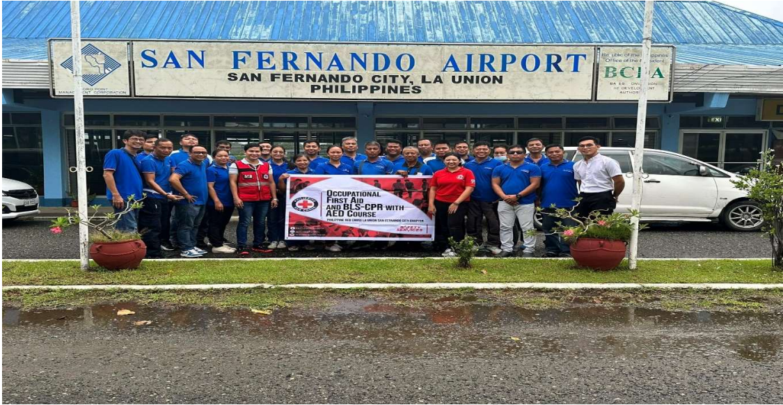
Occupational First Aid and BLS-CPR with AED Course at the San Fernando Airport on August 3-4, 2023.