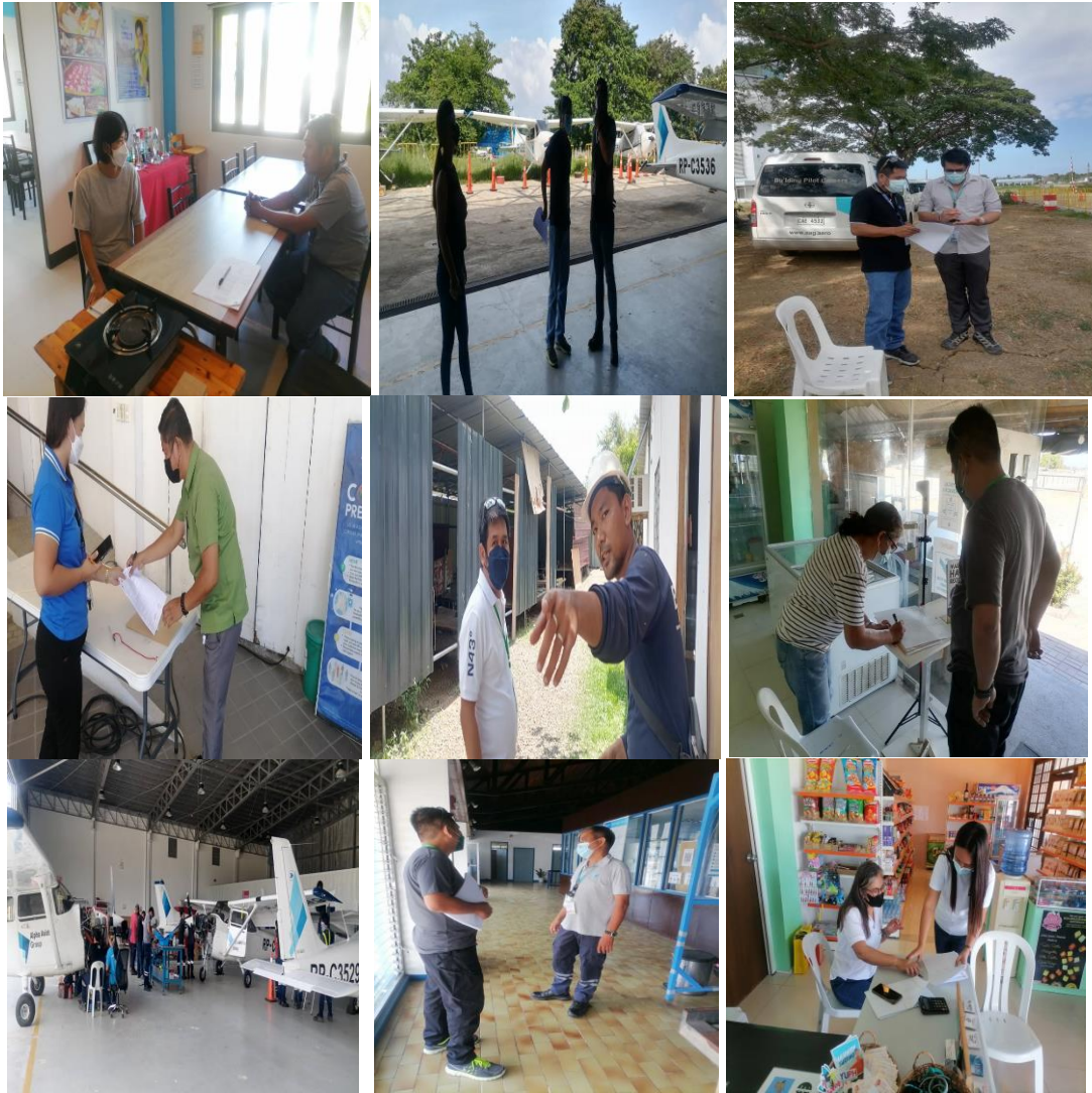
Quarterly inspection of Registered Enterprise